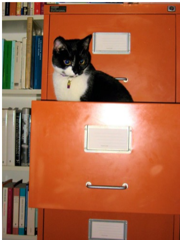
tpholland, "I'm just looking for something.", CC BY 2.0.